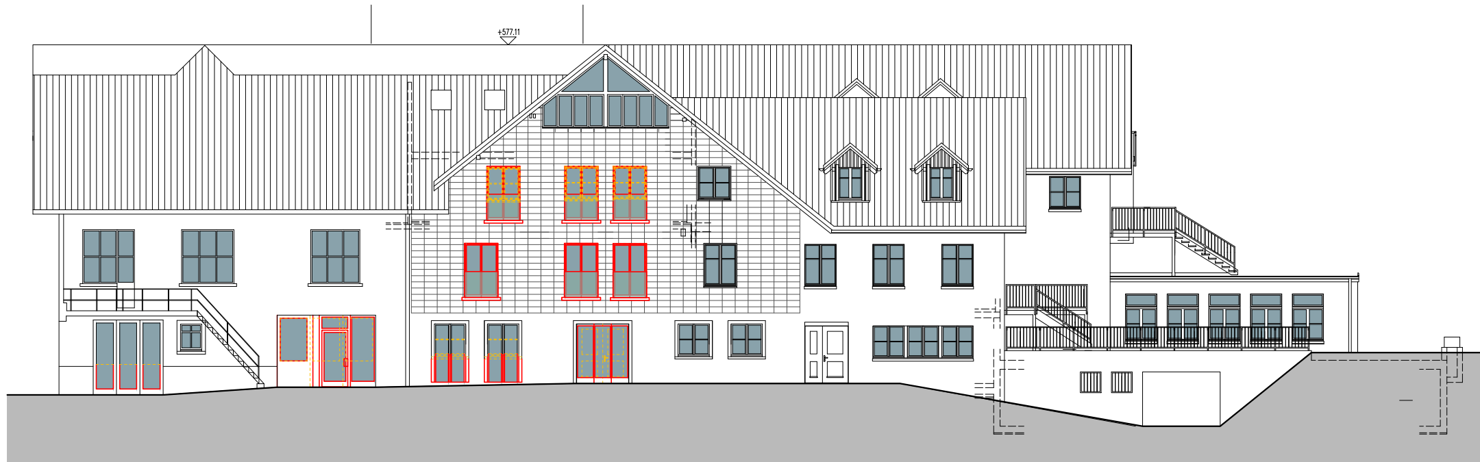
S dfassade 57.1